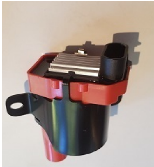
Diagram looking at the connector on the COP (heatsink at the top)

Also an MS1 or MS2 if setup for 5V outputs.